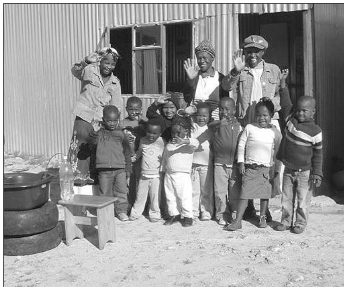
The women running the Playgroup with some of the children, outside the shack which is used as a classroom.