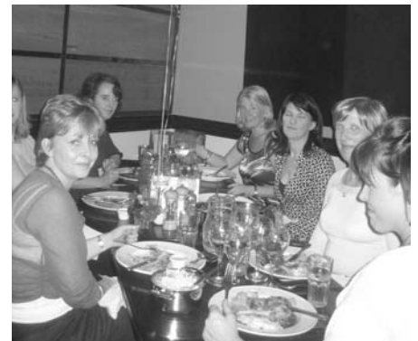
Celebrating 30 years at the 2008 Annual Dinner

takes place on Sunday 4th October in Muckross at 11.15am.