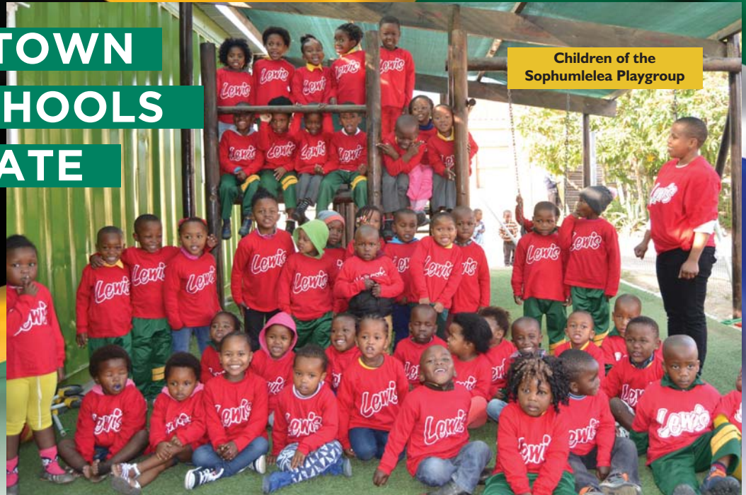
Children of the Sophumelela Playgroup