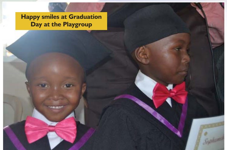
Happy smiles at Graduation Day at the Playgroup

With greetings, love and thanks from Sr Caitriona OP.'