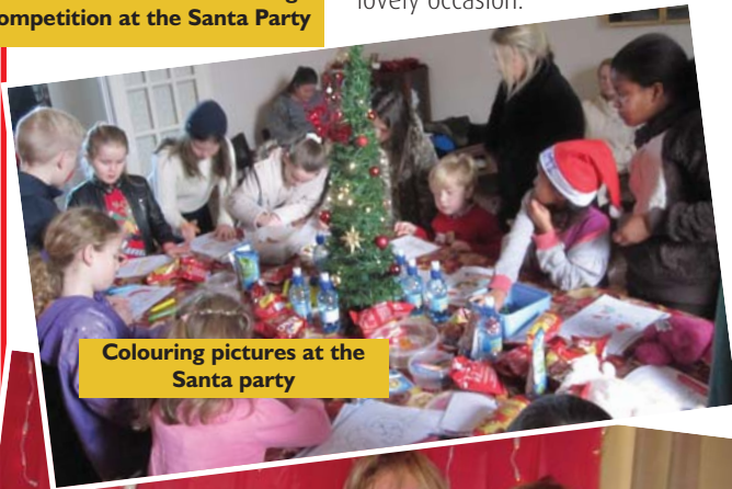
Colouring pictures at the Santa party

A big thank you to our special Santa and the sisters for allowing us to take over their home for the party and all concerned in making this a lovely occasion.