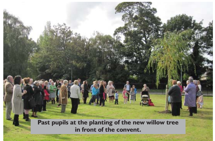
Past pupils at the planting of the new willow tree in front of the convent.