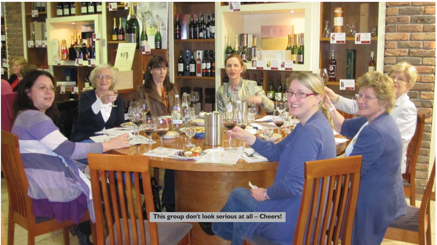
This group don't look serious at all – Cheers!