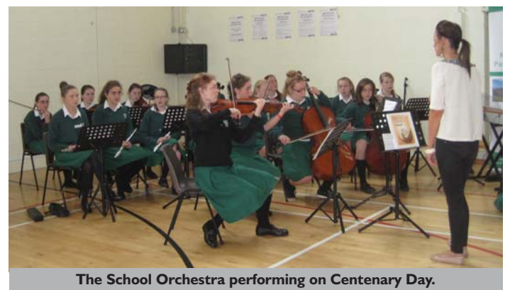
The School Orchestra performing on Centenary Day.