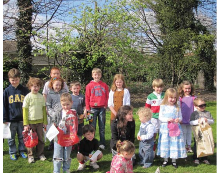
Some of the children waiting for the start of the hunt. We like the cool dude with the shades on the right!

Tickets are €5 each or book of 5 for €20. If you did not receive you tickets with the Muckross Mail or you would like extra tickets please Email: muckrossppu@gmail.com or Telephone 087 638 3683.