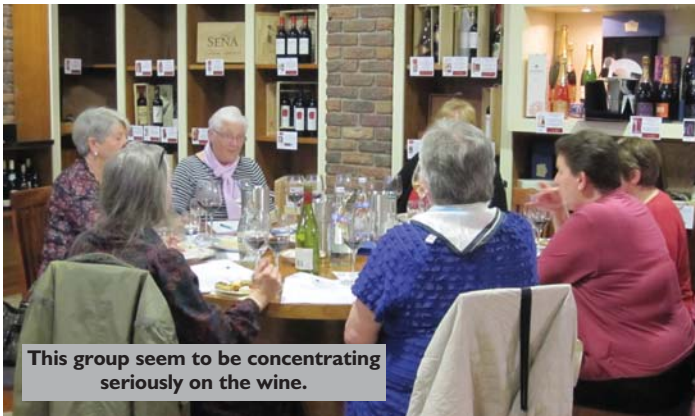
This group seem to be concentrating seriously on the wine.