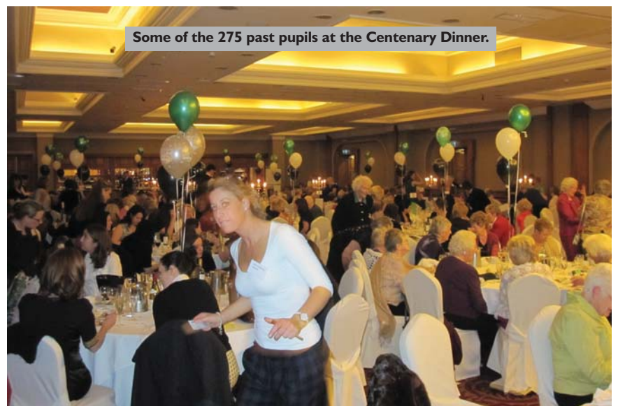
Some of the 275 past pupils at the Centenary Dinner.