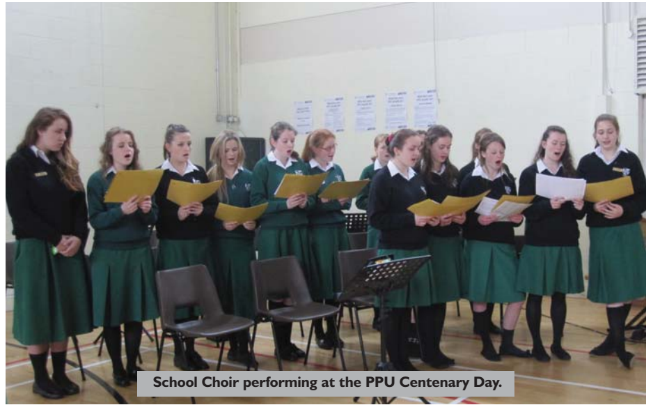
School Choir performing at the PPU Centenary Day.